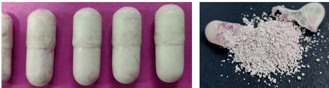
Figure 3: Appearance of EUDRACAP™ enteric capsules and filled dye content after 4 hours of exposure to 0.1N HCl in disintegration test apparatus

This study further confirms the superior acid resistance performance of EUDRACAP™ enteric capsules and its application for protecting the highly sensitive drugs formulations where even a small amount of acid permeation is unacceptable.